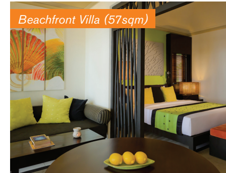
Beachfront Villa (57sqm)

Complementing the energising vibe of crisp ocean air, the cheery interior of the Beachfront Villa is tinged with stimulating lime-green and tangerine orange accents. Put up your feet and tan on the lounge, nap on the verandah or catch some air on our Maldivian Joli swing. This villa sleeps up to four guests.