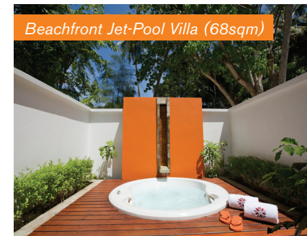
Beachfront Jet-Pool Villa (68sqm)

Bubble over with beachside bliss and enjoy a soak in your private jet-pool. Sheltered by leafy trees, swaying palms and flowering shrubs, the Beachfront Jet-pool Villa, is the perfect coastal hideout for up to four guests. Go on a digital detox and read a paperback on your spacious porch, rinse off in your outdoor shower and chill out with family and friends at this oceanfront playground.