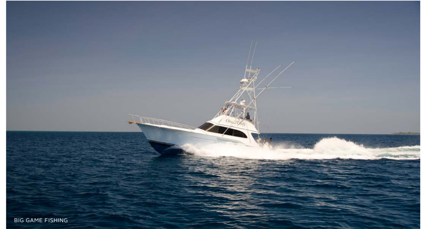
BIG GAME FISHING

Charter your own private boat or enjoy our excursions with privacy.