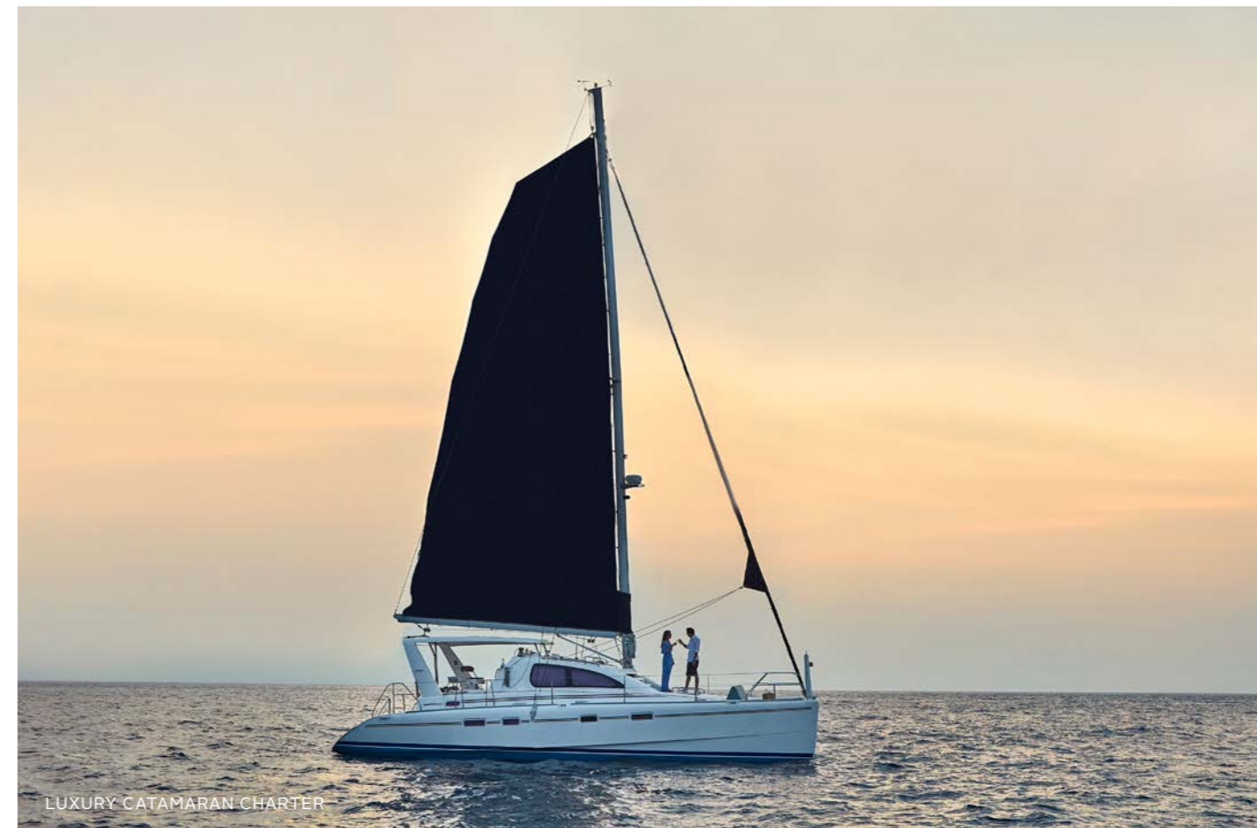
LUXURY CATAMARAN CHARTER

Available on Tuesday, Thursday and Saturday. 7pm