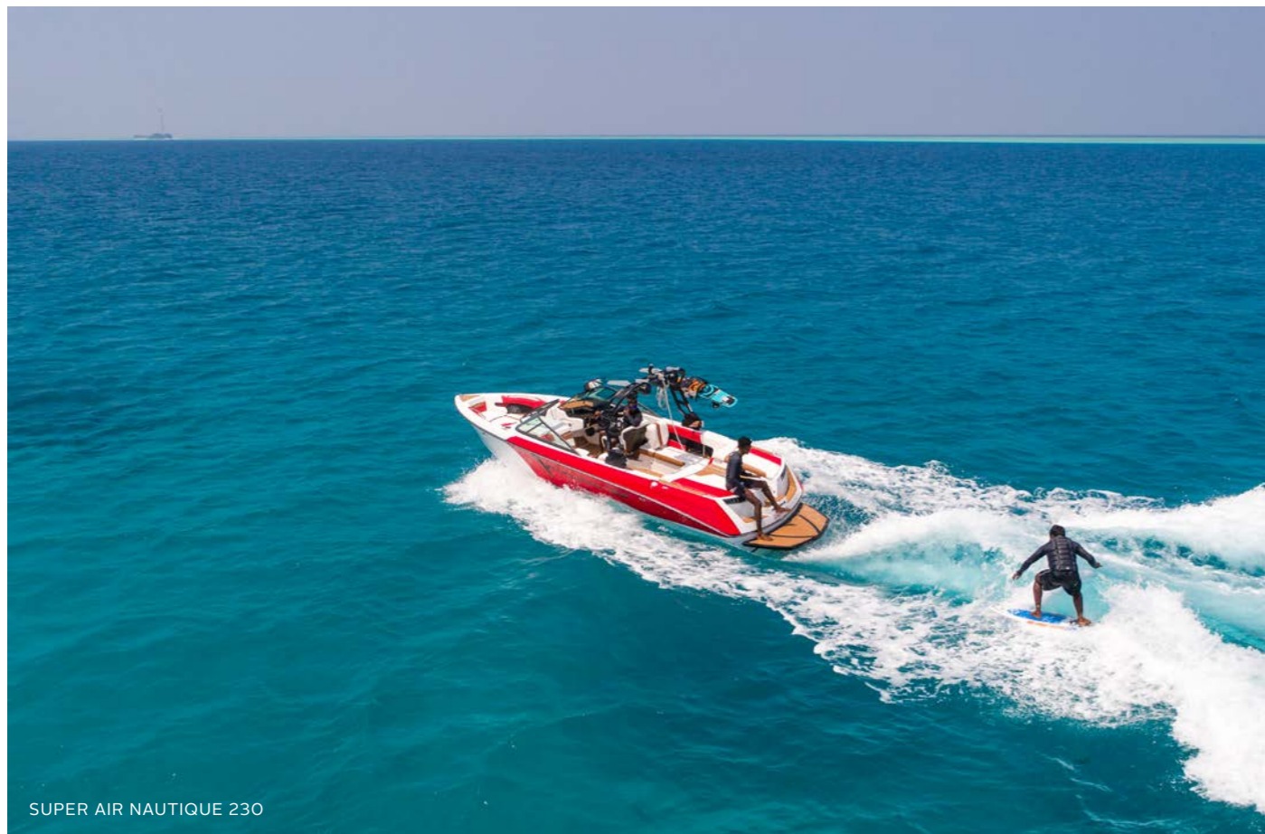
SUPER AIR NAUTIQUE 230