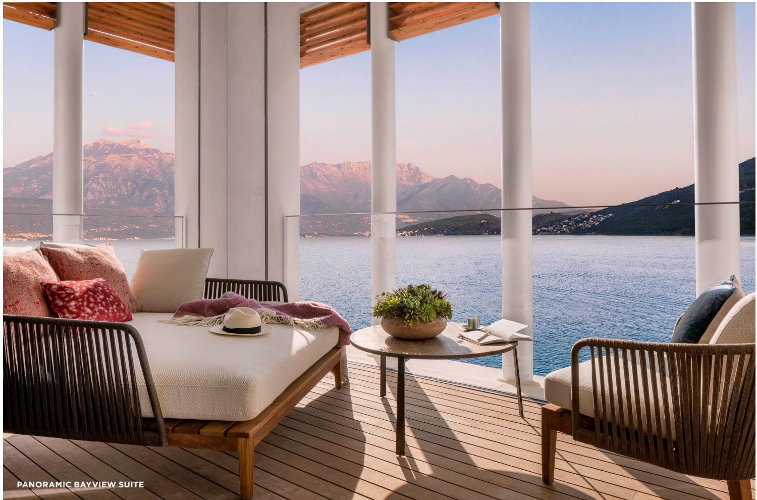
PANORAMIC BAYVIEW SUITE