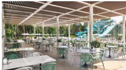
Far East A La Carte