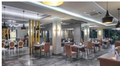
Mexican A La Carte