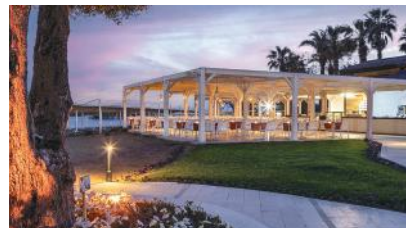
Turkish A La Carte