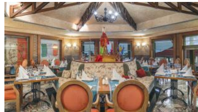
Italian A La Carte