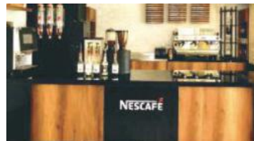
Arcanus Coffe House