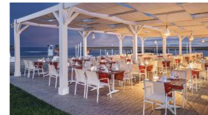
Fish A La Carte

* Arcanus Hotels Sorgun has the right to make concept changes without informing the 3rd person/institution. All right reserve