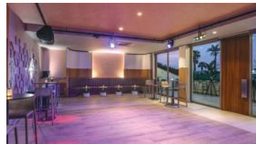
Passion & Disco Cocktail Bar